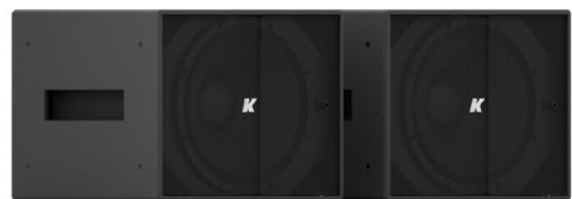
Suspended configuration with optional K-FLY3 flybar.